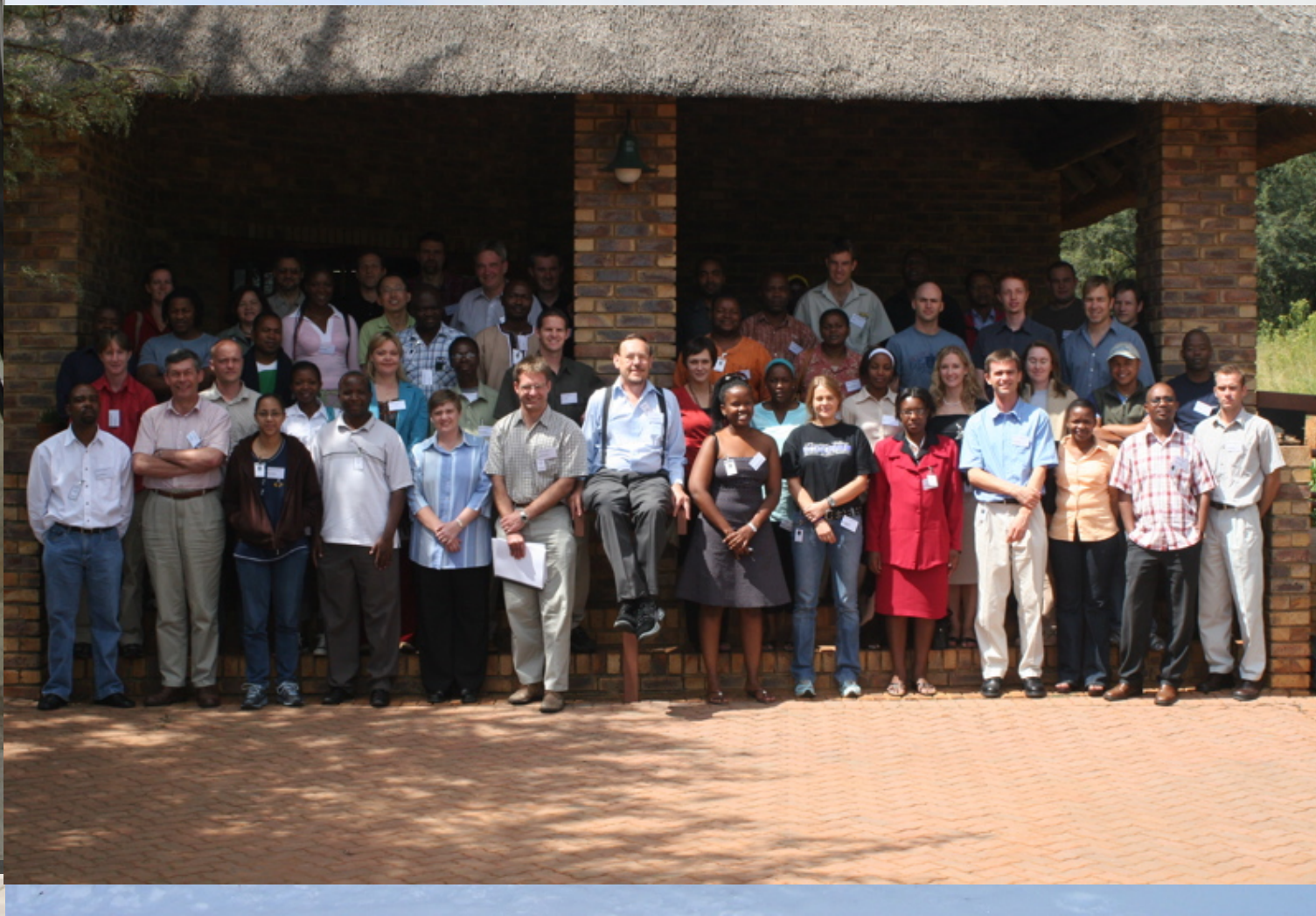
ITSC-15 Maratea, Italy 4 - 10 October 2006